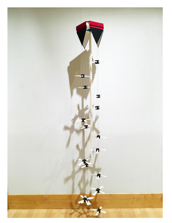
195 Ripples: water(wheel) 2020 Altered book 84"x 13"x 13" $600