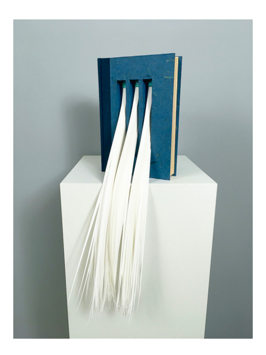
200 Ripples: chute 2020 Altered book 21"x 7"x 2" $250