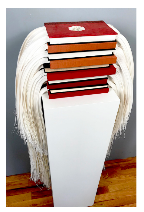
193 Ripples: water(pox) 2020 Altered books 46"x 24"x 12" $900